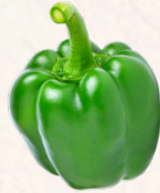
PEPPERS GREEN LARGE 25lb Case British Columbia