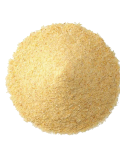
Fire Roasted Onion Granules