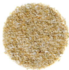
Smoked Minced Onions