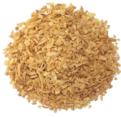
Toasted Chopped Onions