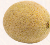
CANTALOUPE MELON 12ct Case California