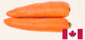
CARROT JUMBO 50lb Sack British Columbia