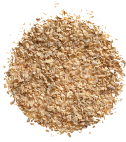
Roasted Chopped Garlic