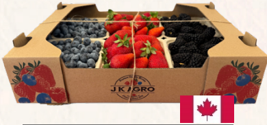
SUMMER BERRY MIXER 5lb Case British Columbia