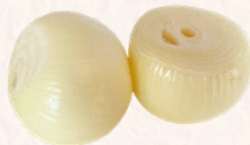
ONIONS YELLOW PEELED 25lb Bag