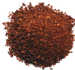
Ancho Chili Flakes