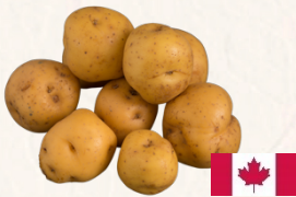
POTATOES YELLOW NUGGETS (SMALL) 50lb Case Vancouver Island