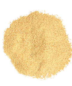
Roasted Garlic Granules