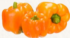
PEPPERS #1 ORANGE EXTRA LARGE 11lb Case British Columbia