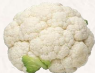
CAULIFLOWER CELLO LARGE 9ct Case California