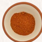
TACO SEASONING [DRIED SPICE] 500g