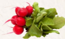
RADISHES BUNCHED 48ct Case British Columbia