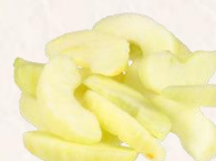
APPLES SLICED IQF [FROZEN] 2x2.5kg Case