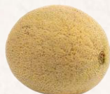
CANTALOUPE MELON 12ct Case Mexico