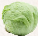
LETTUCE ICEBERG 24ct Case California