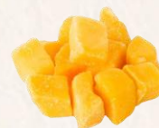
MANGO CHUNKS IQF [FROZEN] 5x1kg Case