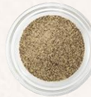
PEPPER BLACK 32 MESH [DRIED SPICE] 2.5kg