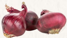
ONIONS RED #1 JUMBO 25lb Sack Washington