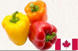
PEPPERS MIXED ORANGE/RED/YELLOW 10/2lb Case British Columbia