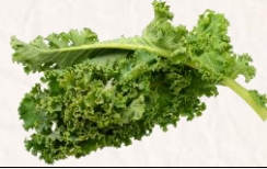
KALE GREEN 24ct Case Vancouver Island