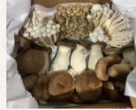
MUSHROOMS EXOTIC MIX 3lb Case Import