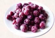
CHERRIES RED SOUR PITTED IQF [FROZEN] 5x1kg Case