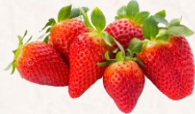
STRAWBERRIES DRISCOLL'S 8/1lb Case Mexico/California