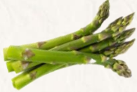
ASPARAGUS GREEN STANDARD 11lb Case Mexico