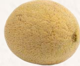
CANTALOUPE MELONS 12ct Case California