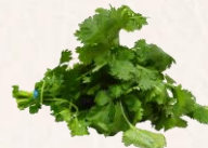
CILANTRO BUNCHED 60ct Case Mexico